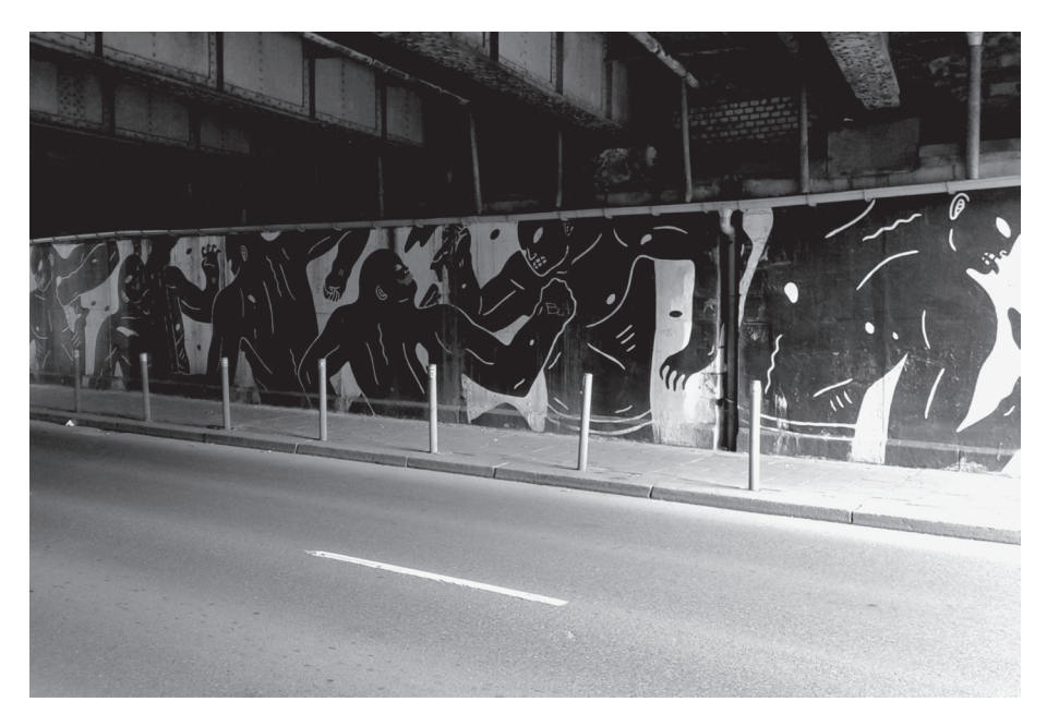
2. Black mural, Artist: Cleon Peterson, Francuska street - viaduct, Katowice