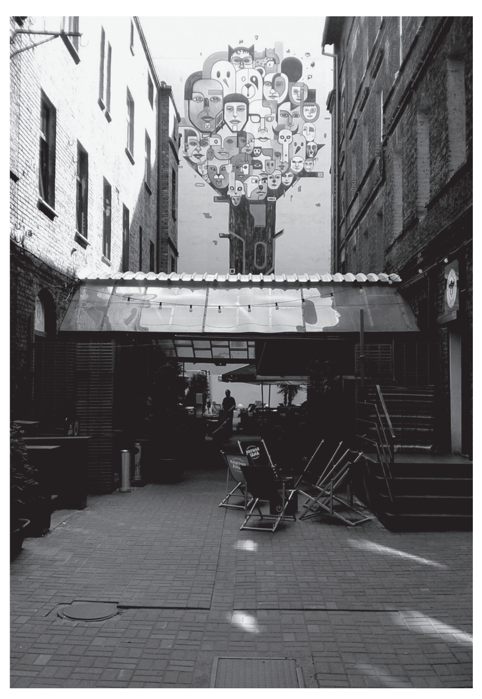
1. Face Tree mural, Artist: Raspazjan, 3 Maja street 38, Katowice